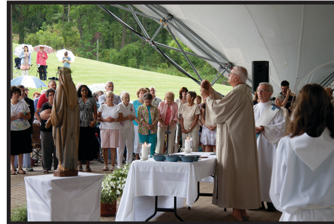
Outdoor Feast Day Mass celebrated at the Perinton Community Center Shell

"Lord, what do you want me to do with all the gifts You have given me?"