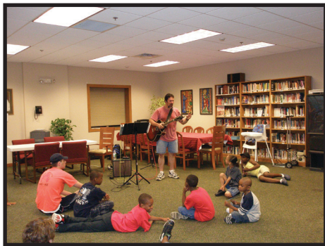
Summer camp for inner city kids