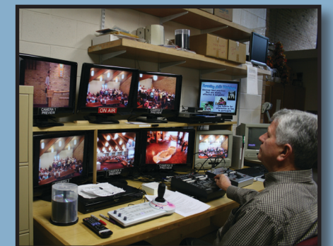
All weekend Masses and special events at Church are broadcast over the internet for those unable to be present

We are an all inclusive, welcoming, compassionate community united by a faith that is alive and growing. As sisters and brothers baptized in Christ, our mission is to be Christ for one another, our community, and the world by teaching as Jesus did, loving as Jesus loved, serving as Jesus served, and by seeing in every face the face of Our Lord Jesus Christ.