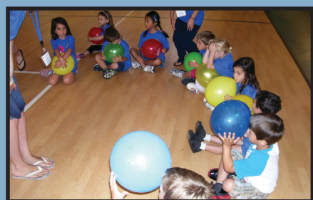
Vacation Bible School for our younger ones