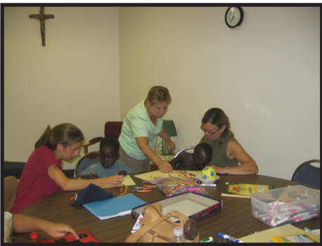
Homeless families hosted at our Parish several times a year