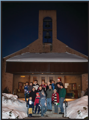
Christmas caroling from Church to Fairport Baptist Home, organized by the Parish Life Committee