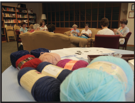
Shawls, capes and blankets made to comfort those affected by illness or tragedy