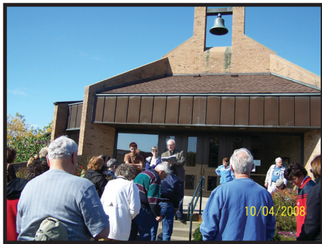
Pets are blessed in honor of St. Francis of Assisi