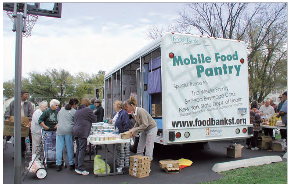
Three mobile food pantries travel thousands of miles annually, distributing healthy food throughout six Southern Tier counties.

In February, 2011, the Food Bank moved into its new operations center and the bounty for needy