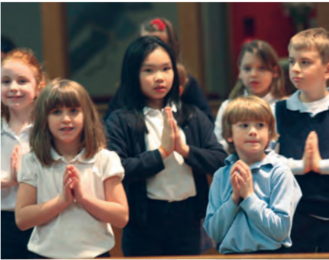
ST. PIUS TENTH, CHILI