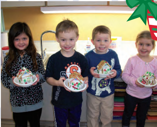
ST. JOSEPH, PENFIELD