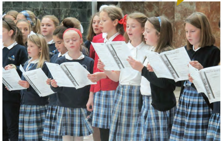
ST. LOUIS, PITTSFORD