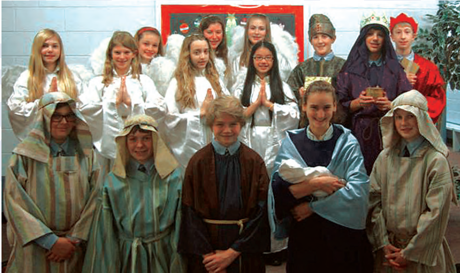
ST. MARY, CANANDAIGUA