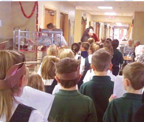
ST JOSEPH, AUBURN