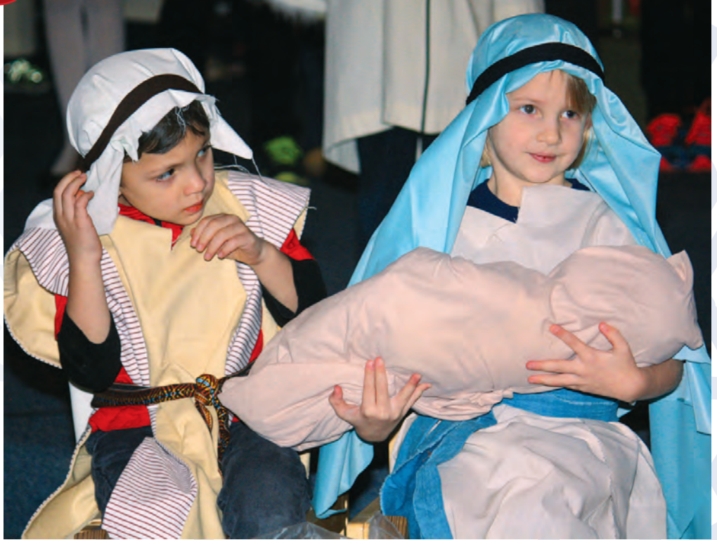
ST. MARY OUR MOTHER, HORSEHEADS

During the Christmas season, a number of our students participated in festive events that included pageants, liturgies, and singing performances by St. Joseph, Auburn at Cayuga County Nursing Home, St. Louis, Pittsford at Eastview Mall and the St. John Neumann Spanish Choir at numerous school functions.