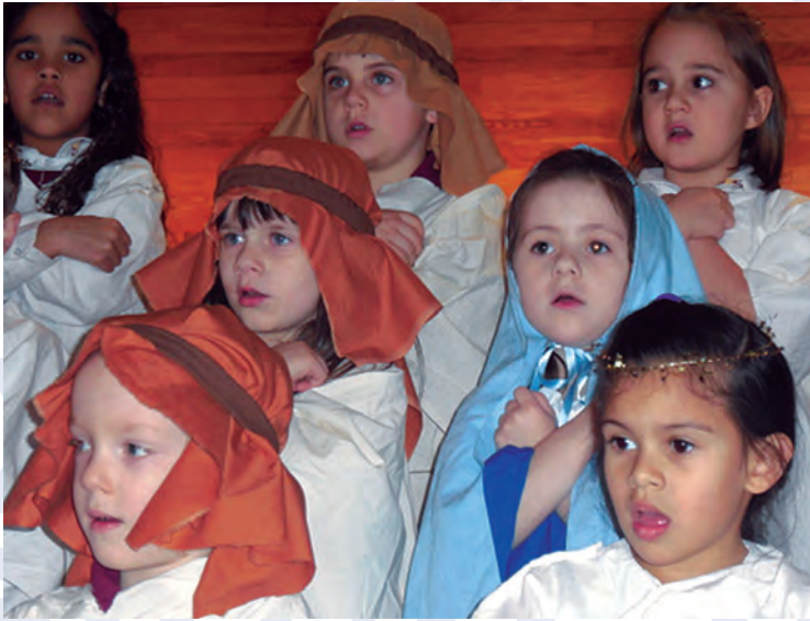
ST. KATERI, ROCHESTER