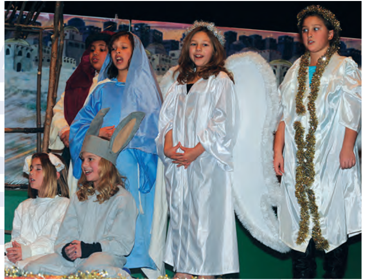
HOLY FAMILY, ELMIRA