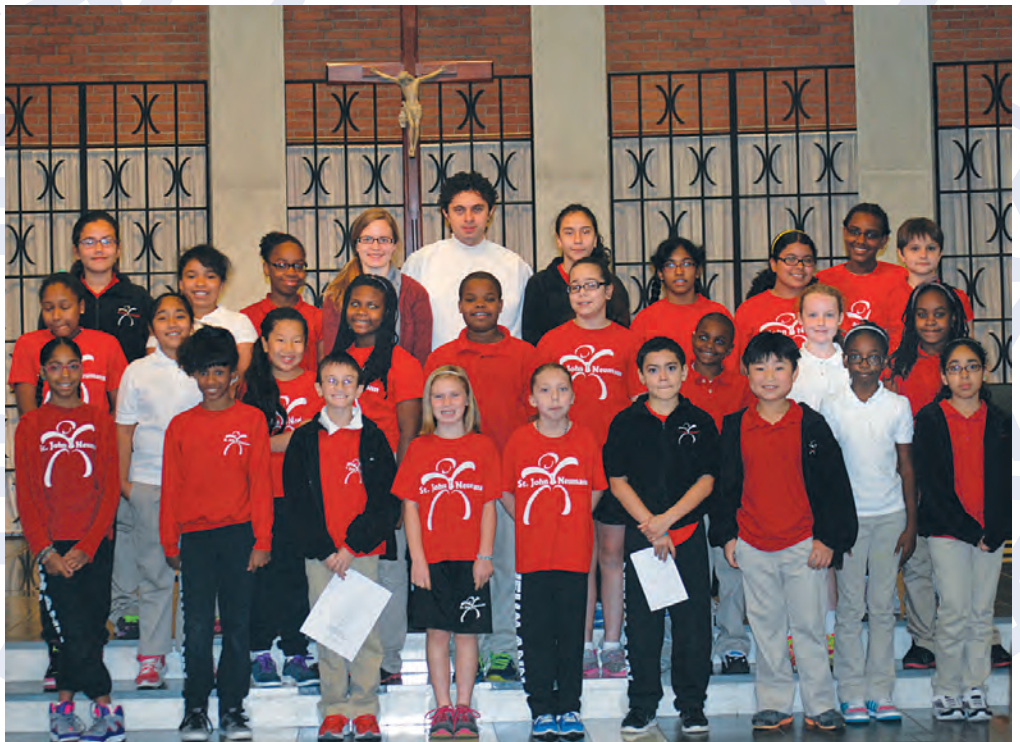
ST. JOHN NEUMANN, ROCHESTER