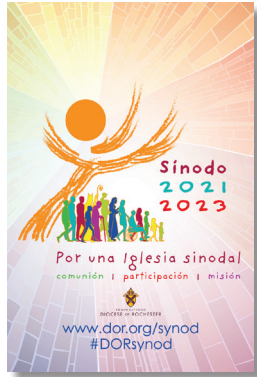
(English) Examples (Spanish)