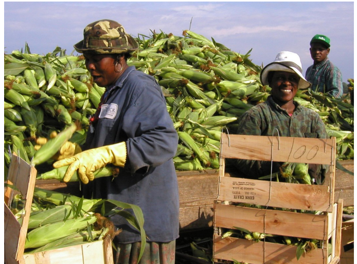
Farmworkers in Cayuga County

Decades later, New York State law, copied from federal law, continues to reflect this Jim Crow-era prejudice. From the beginning these exclusions did not have an economic basis. They came into being because of the sin of racism in our country.