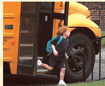
Holy Family, Elmira