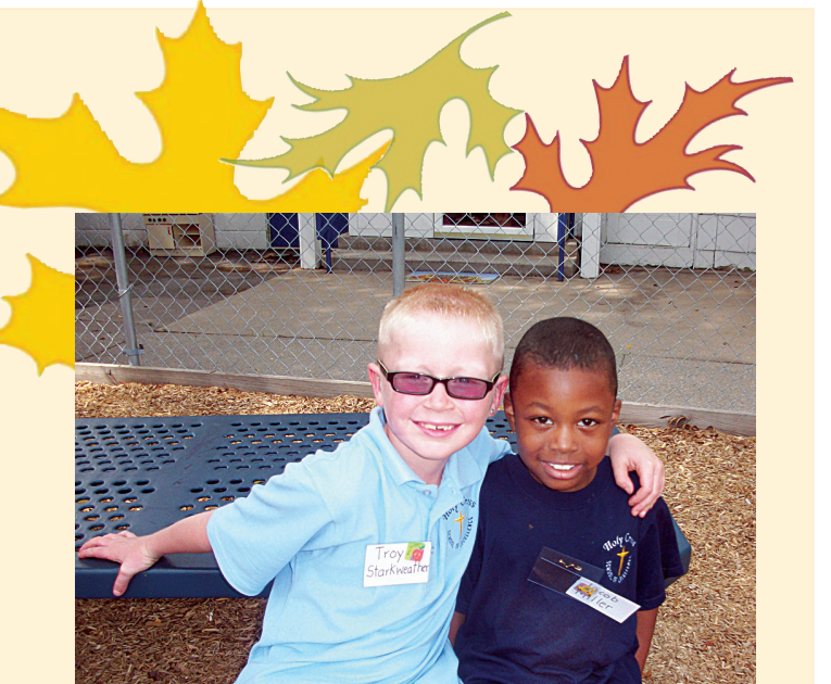
Holy Cross, Rochester