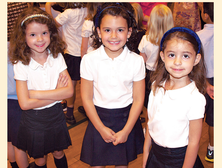
St. Joseph, Penfield