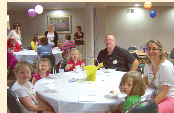
St. Mary's Canandaigua