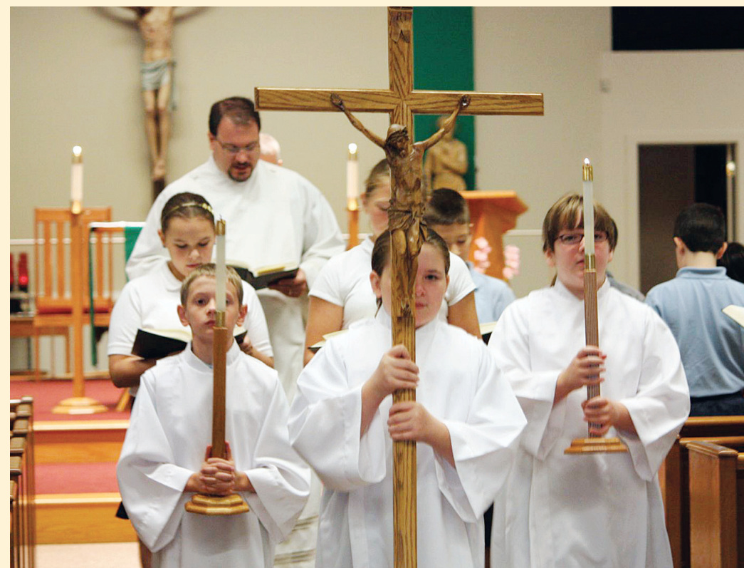
St. Pius X, Chili