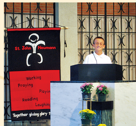
St. John Neumann, Irondequoit