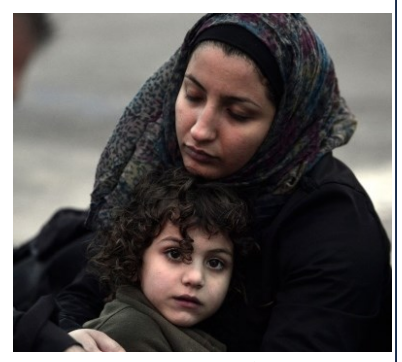
A Syrian mother tries to warm up her daughter after they arrived on the island of Lesbos.

With respect to migrants, too often in our contemporary culture we fail to encounter them as persons, and instead look at them as others or render them invisible. We do not take the time to engage migrants in a meaningful way, as fellow children of God, but remain aloof to their presence and suspicious of their intentions. During this National Migration Week, let us all take the opportunity to engage migrants as community members and neighbors – all of whom are worthy of our attention and support."